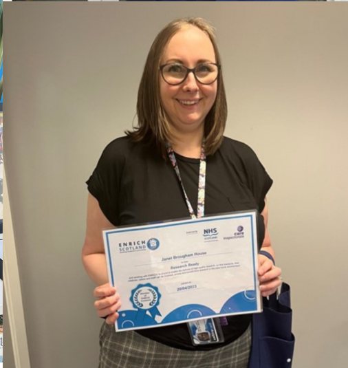
And in and around Dundee we have the always smiling staff of ASC Balbeggie, Clement Park and Brougham House proudly accepting their certificates.