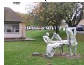
Occupational Therapy Department WORKING HEALTH SERVICES is here