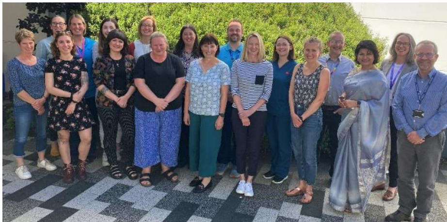
Cohort 2 Clinical Academic Research Gateway Awards September 2023

Cohort 2 of the awards were launched in March 2023 and 20 applications were received with 11 successful applicants commencing in September 2023. The profile of the awards were five First Steps into Research, one Masters in Research, one Pre-doctoral, two Post-doctoral and two Advanced methodologies.