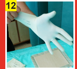
12 Apply sterilized gloves