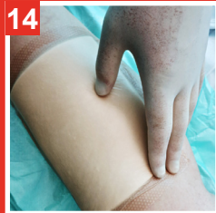
14 Dress Wound using NTT