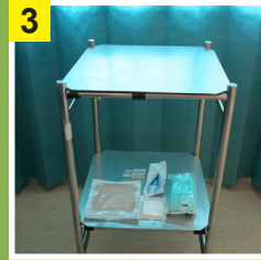
3 Gather dressing pack & equipment & place on bottom shelf.