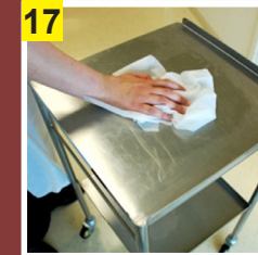
17 Clean trolley according to local policy