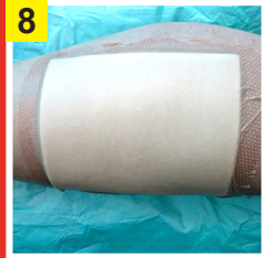
8 Place sterilized drape under the wound