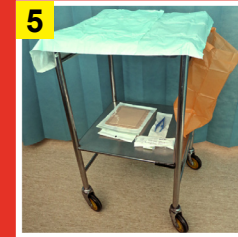
5 Open Critical Aseptic Field (sterilized drape using NTT)