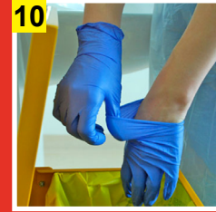
10 Dispose of gloves