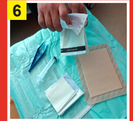
6 Open equipment using NTT