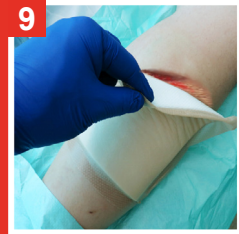
9 Remove dressing using NTT & dispose of dressing in waste bag