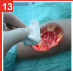
13 Clean Wound using NTT