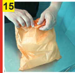
15 Dispose of equipment, waste, gloves & apron, then...