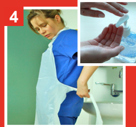
4 Apply apron & clean hands.