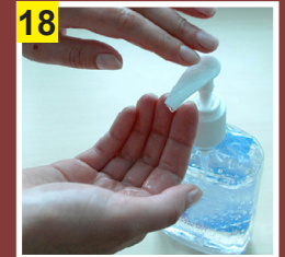
18 Clean Hands with alcohol hand rub or soap & water.