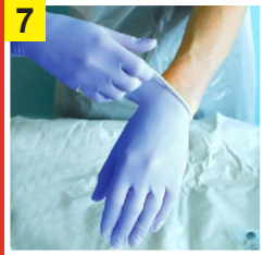
7 Apply non-sterilized gloves