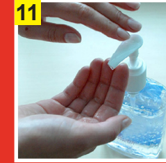
11 Clean hands with alcohol hand rub or soap & water