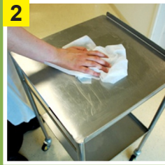
2 Clean Trolley according to local policy.