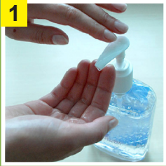
1 Clean Hands with alcohol hand rub or soap & water.