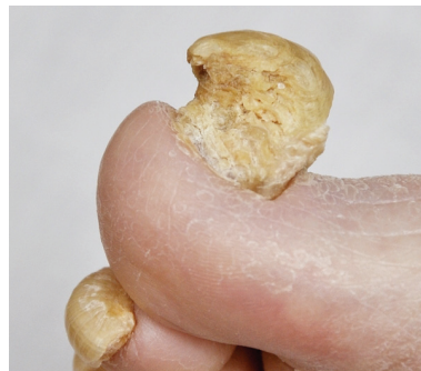
Grossly thickened nails