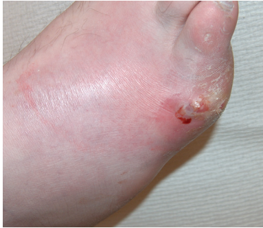
Foot ulcer with active cellulitis