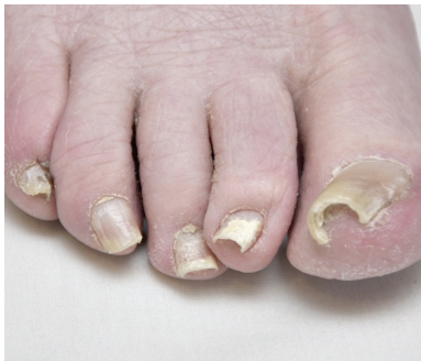
Long nails / curved nails not causing any problems