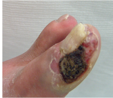
Foot ulcer with necrosis