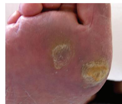
Painful hard skin and corn Referral : Soon