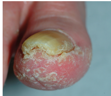
Slightly thickened nails