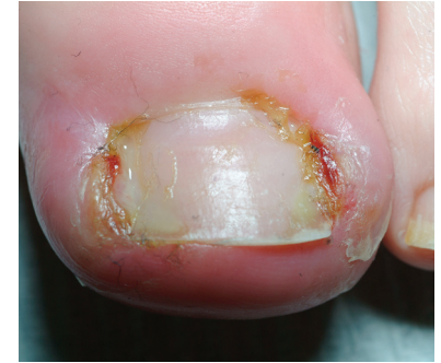
Onychocryptosis (ingrowing toe nail)