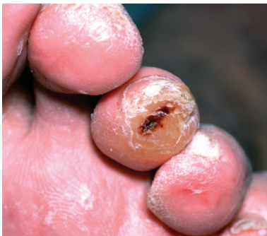
Callus with extravasation Referral: Soon, Diabetes Urgent